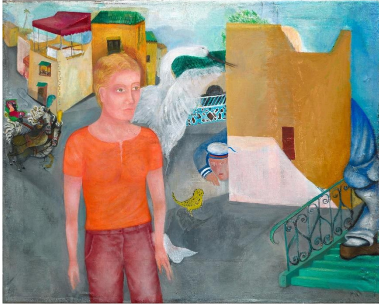
Katharina Wulff, The Departure , 2012, oil on canvas, 65 × 52 cm, Courtesy the Artist and Greene Naftali, New York