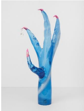
Slavs and Tatars, Stiletto 'C', 2024, hand-blown glass, hand-made faux nails, 60x30x25 cm, Photo Marjorie Brunet Plaza. Courtesy Kraupa-Tuskany Zeidler, Berlin