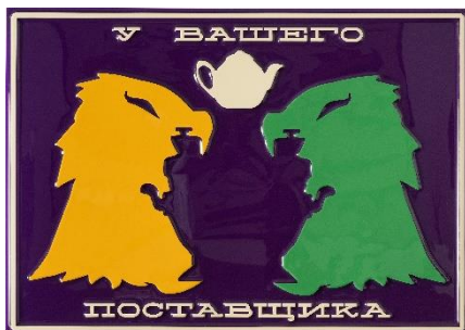
Slavs and Tatars, This not that, 2024, vacuum-formed plastic, acrylic paint, 71x100 cm