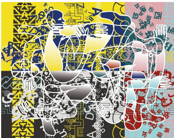
Visual Viron Erol Vert – Garden of Ornaments, Staatliche Kunsthalle Baden-Baden, 2024 © Viron Erol Vert