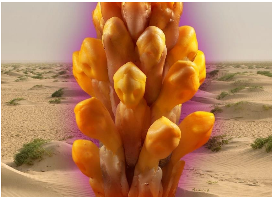
Ayman Zedani, rendering for The Keepers , 2022. © Ayman Zedani.