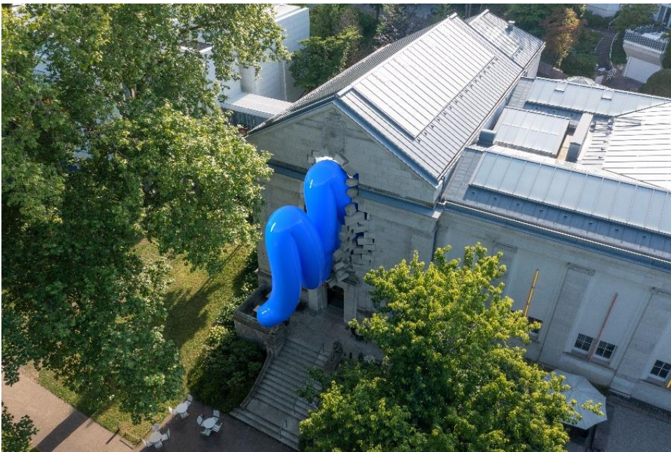
Manuel Rossner, Spatial Painting Baden-Baden , 2022. © Manuel Rossner.

Please note: When using the images, they should not be cropped and must not be overwritten with text. The respective captions are mandatory. Please note in any case the © of the images.