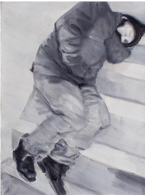
Olga Chernysheva, Untitled (Resting on the Stairs) , 2012. © Olga Chernysheva and the Gallery Diehl, Berlin.