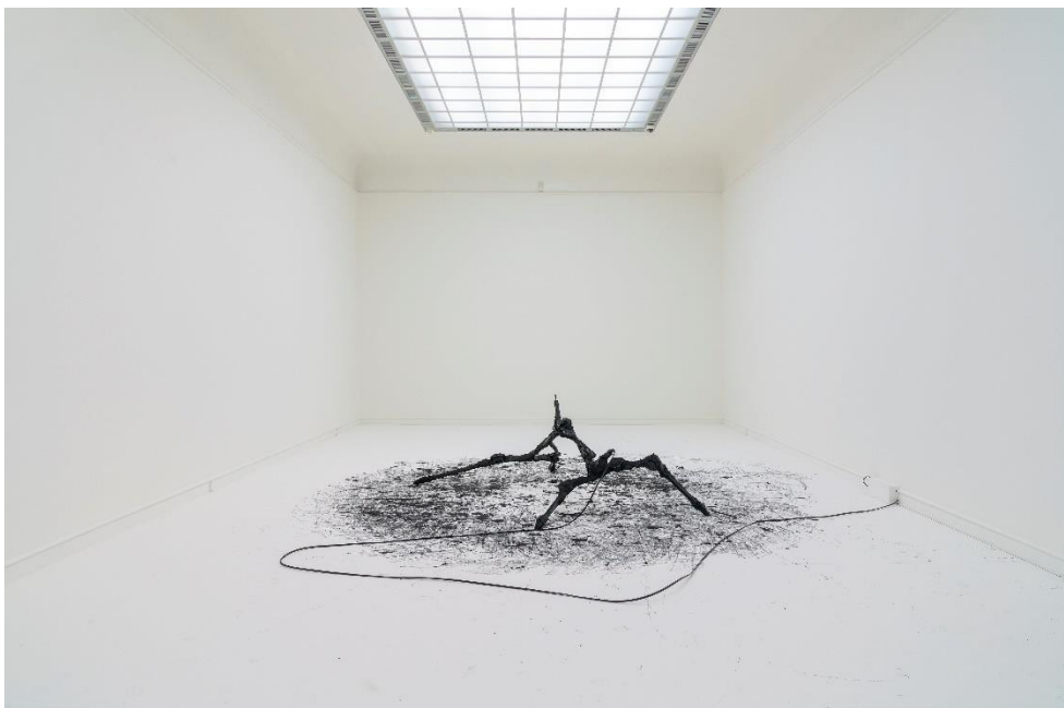
Muhannad Shono, On loosing meaning , 2021, Staatliche Kunsthalle Baden-Baden, © Staatliche Kunsthalle Baden-Baden, Photo Günzel.Rademacher.